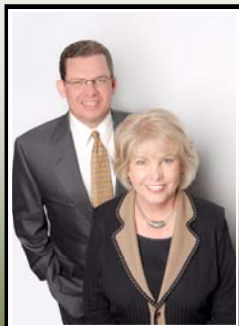
THE McCRORY TEAM